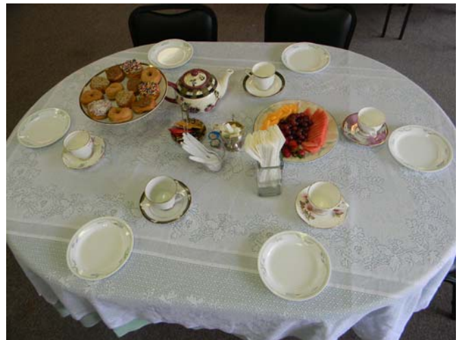
Last year's Teddy Bear Picnic